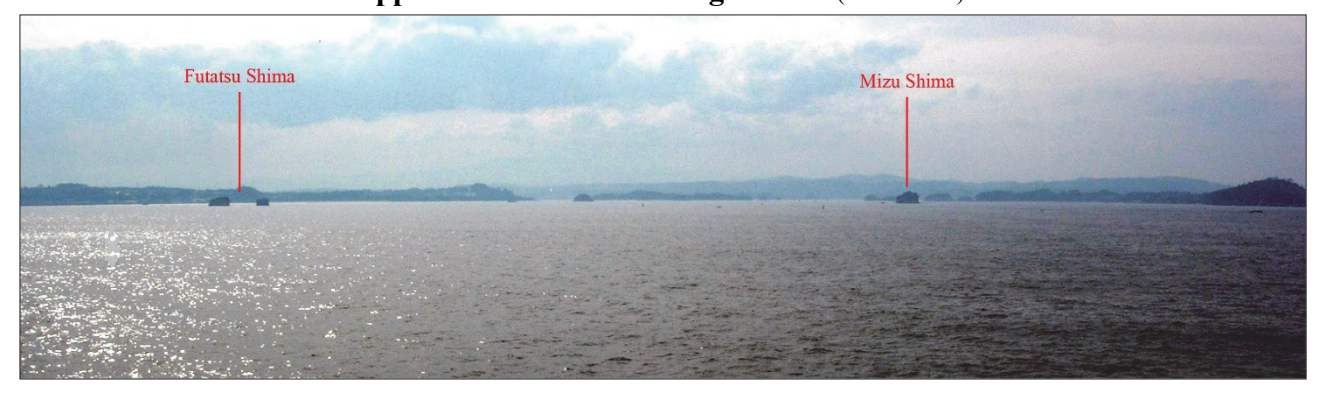
Entrance of Sendai-Shiogama Ko (Shiogama Ku)

General information. Matsushima Wan is entered between Kayano Saki (38° 19' N, 141° 11' E) at the SE extremity of Miyato Shima and Hanabuchi Saki (38° 18' N, 141° 05' E) situated about 4.5 M WSW of Kayano Saki. The water is shallow and interspersed with many islands and rocks; there are many dangerous reefs inside and outside the bay.