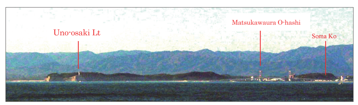
The vicinity of Unoo Saki seen from the NE