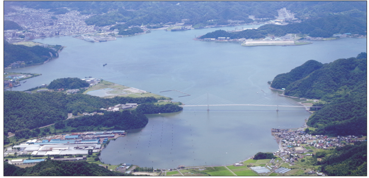
Higashi Ko {East harbour in Maizuru Ko}